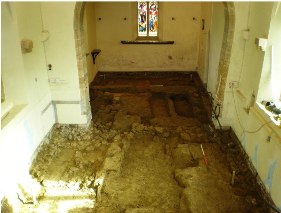
Plate 1. The chancel and east end of the nave after excavation, showing the revealed foundations and grave outlines. Scales 1metre.