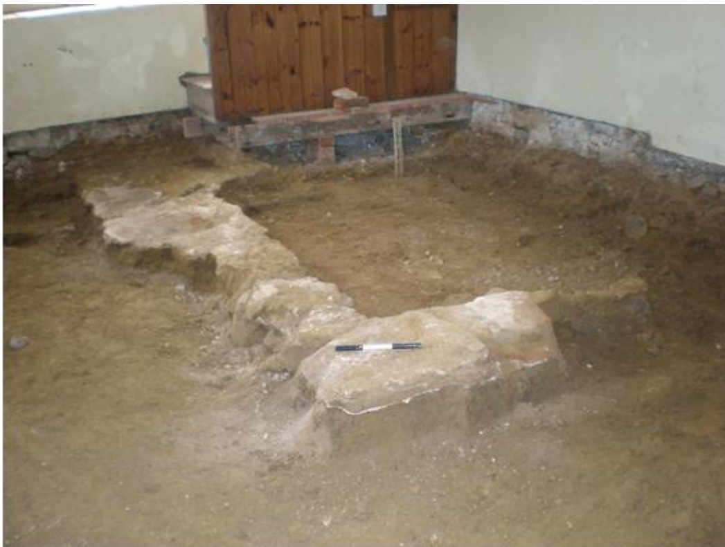
Plate 3. Sequence of floors and graves K excavated in the west end of the nave. The scale (0.30m) lies on top of the primary floors. Beyond is the lime mortar patching (24) above a sequence of graves. View from the south-east.