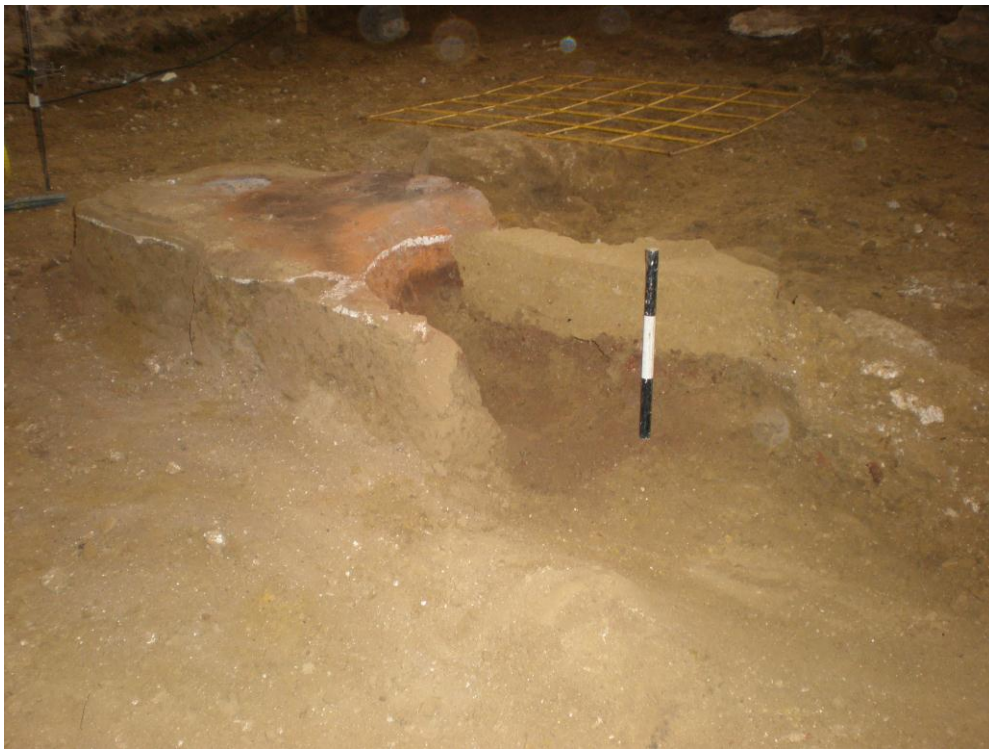
Plate 2. The surviving area of primary floors in the west end of the nave. The white lime mortar of the primary floor lies above the clay subsoil and is overlain by laminated earth surfaces, locally very reddened by the heat from the furnace pit. The scale (0.30m) stands against a section of the infill of this pit. View from the north-east.